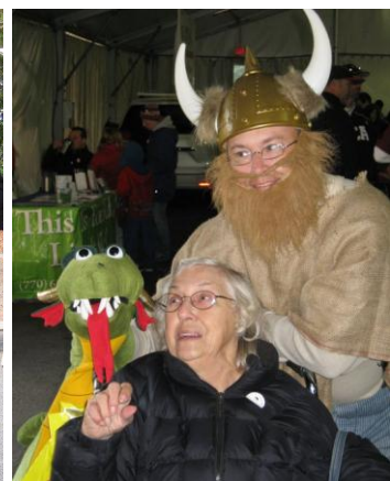
Friends and family enjoying the 2010 MDA Walk of Hope at Zoo Atlanta